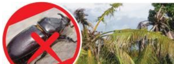
Figure 1: CRB Damage (source : http://www.spc.int/blog/a-new-biotype-of-coconut-rhinoceros-beetle-discovered-in-the-pacific/ )

In 2016, the Asia-Pacific region produced an estimated 51.5 million tonnes of coconuts, representing around 86% global production 3 . Aside from the ravages of cyclones and other extreme weather events, this production is being increasingly jeopardised by two key biotic threats: